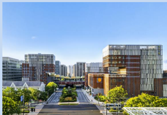
Zhengli Campus No. 558 Zhengli Road

Graduate Exchange Coordinator International Exchange & Cooperation Office