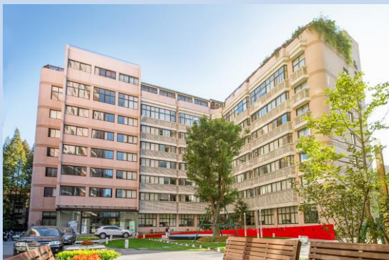
Guoshun Campus No. 670 Guoshun Road