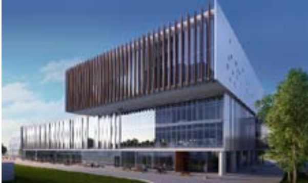
Rendering of York University's new Student Centre via newstudentcentre.ca .

The 126,000 square foot building was designed by global design firm CannonDesign with EllisDon contracted for construction services. Design principles have been structured around accessibility, community safety and environmental sustainability. Learn more at yusc.ca .