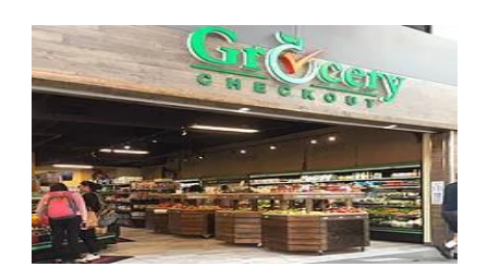
Grocery Checkout York Lanes