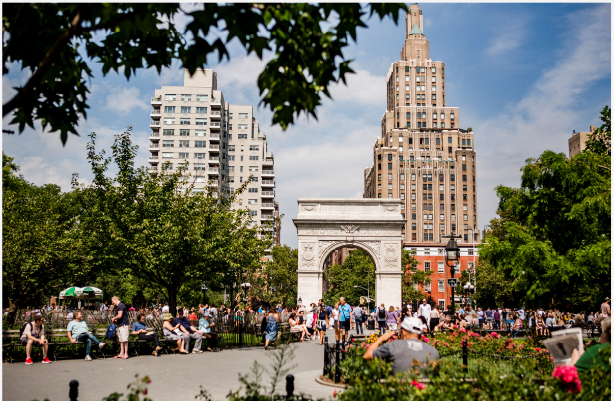
Washington Square Park

There are 60-70 students in most MBA electives.