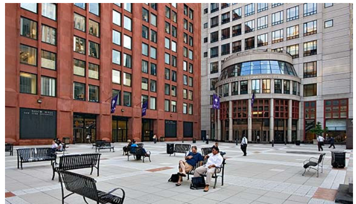
The Kaufman Management Center at NYU Stern