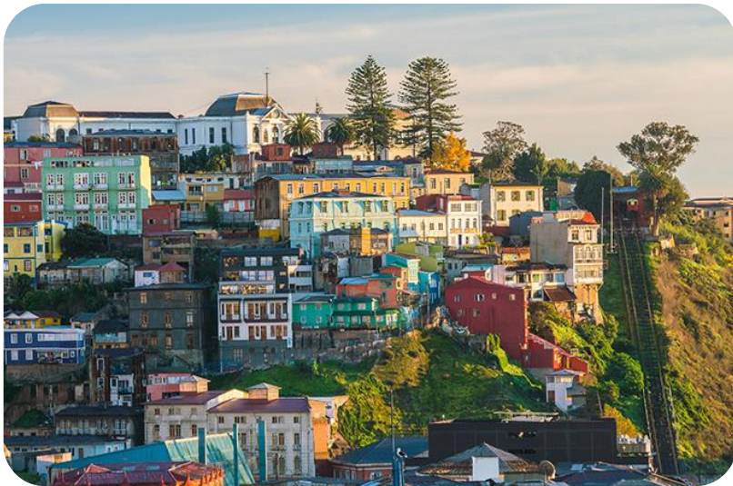
Valparaiso & Viña del Mar