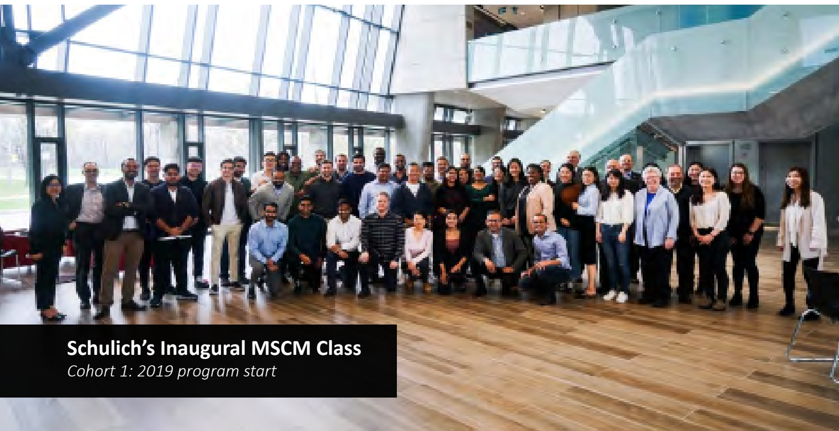
Schulich's Inaugural MSCM Class Cohort 1: 2019 program start