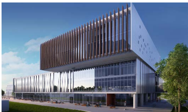
Rendering of York University's new Student Centre via newstudentcentre.ca .

The 126,000 square foot building was designed by global design firm CannonDesign with EllisDon contracted for construction services. Design principles have been structured around accessibility, community safety and environmental sustainability. Learn more at yusc.ca .