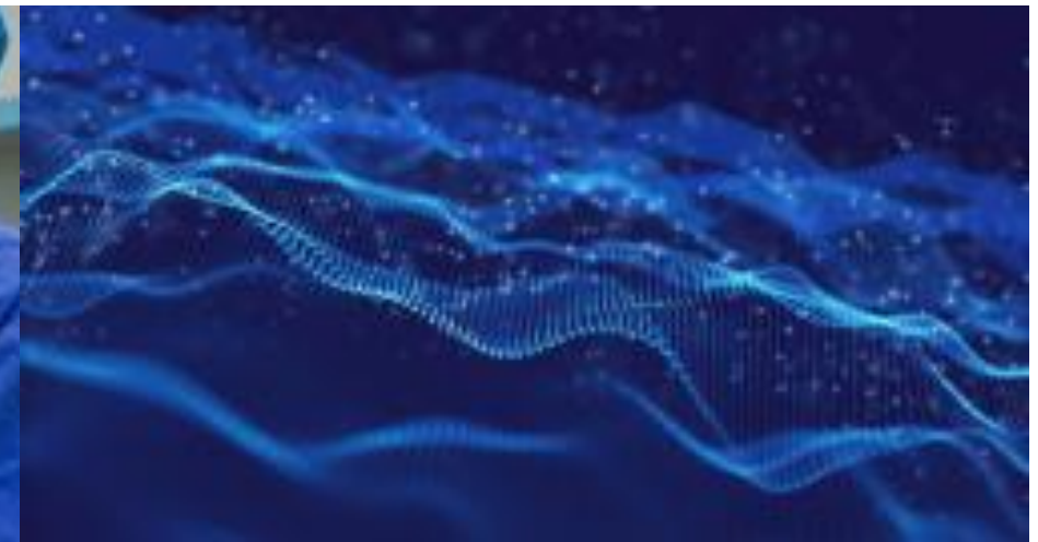
Income Security & FinTech