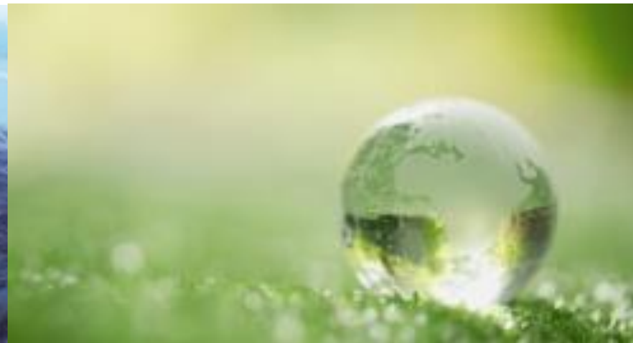
Environment & Energy