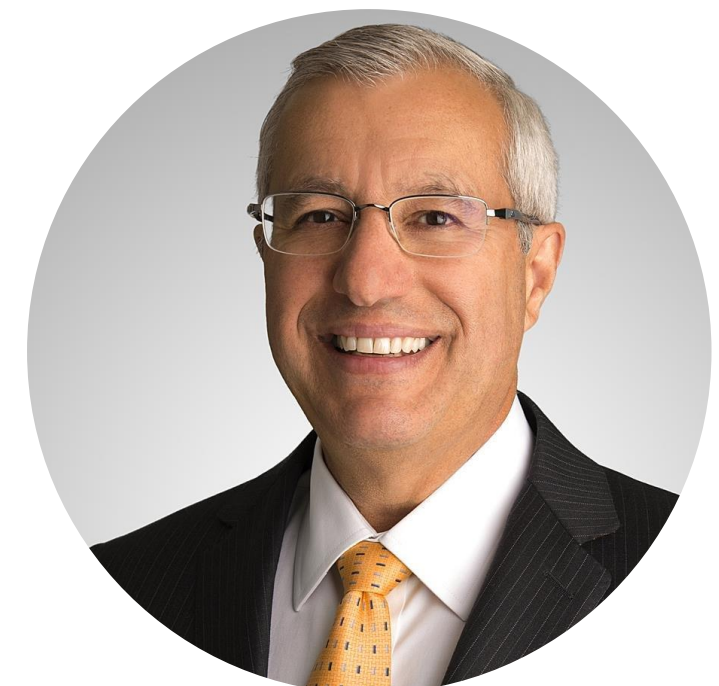
H.E. Victor Fedeli Minister of Economic Development