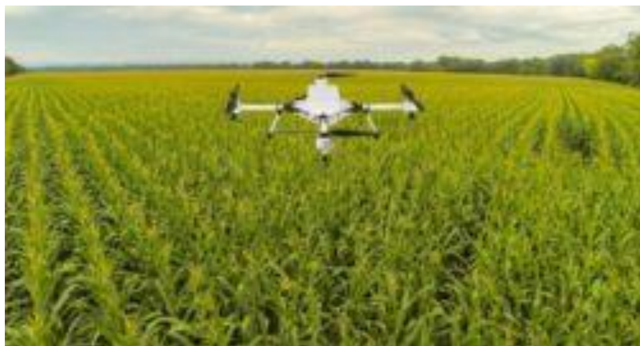
Food & Agriculture