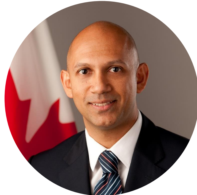
H.E. Nadir Patel High Commissioner of Canada in India