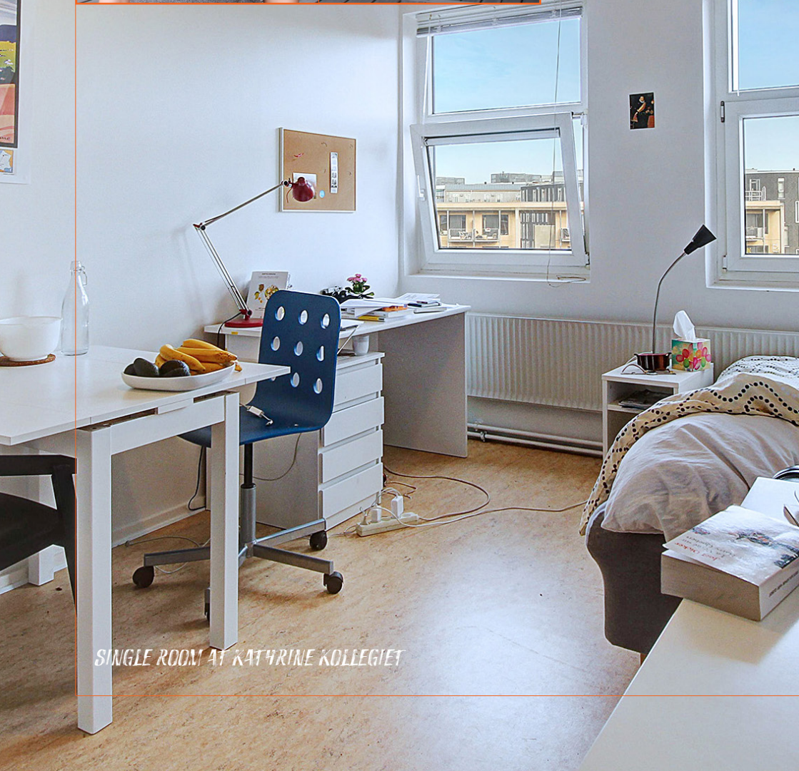
SINGLE ROOM AT KATHRINE KOLLEGIET

YORK UNIVERSITY, SCHULICH SCHOOL OF BUSINESS, CANADA