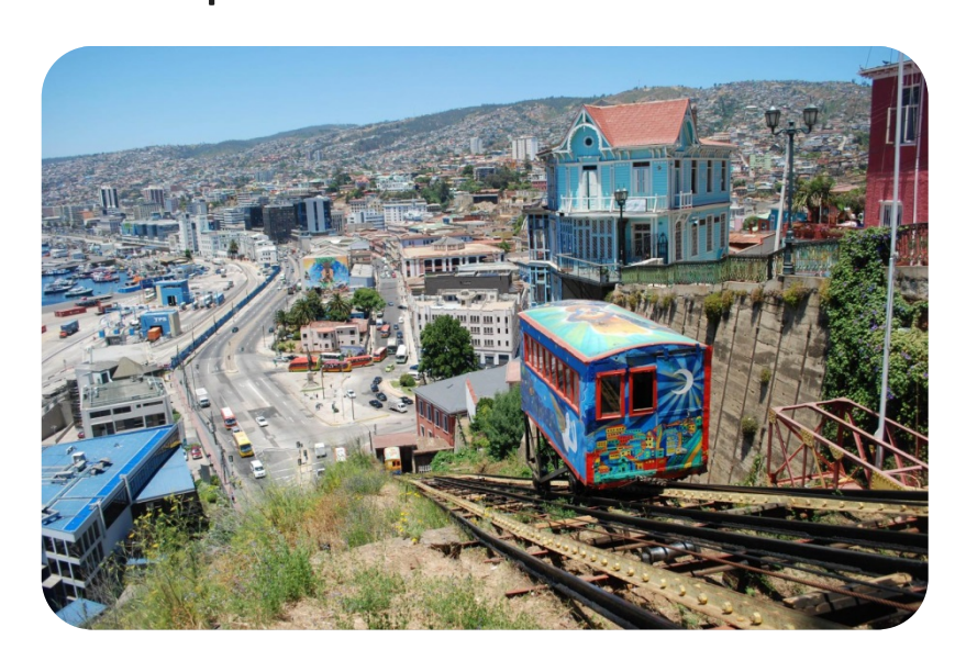
Valparaiso & Viña del Mar