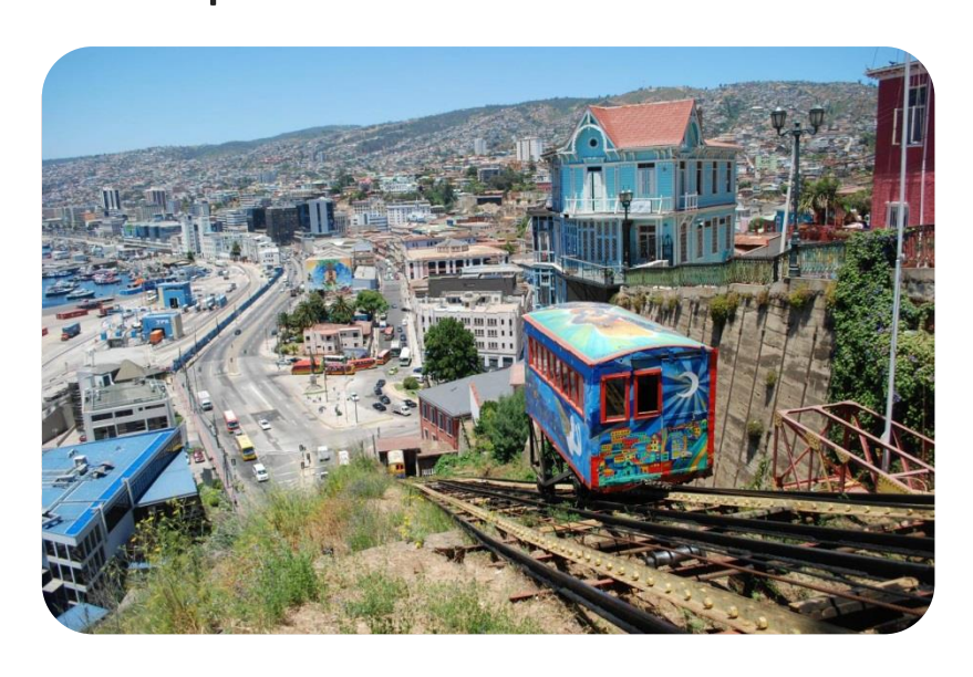
Valparaiso & Viña del Mar