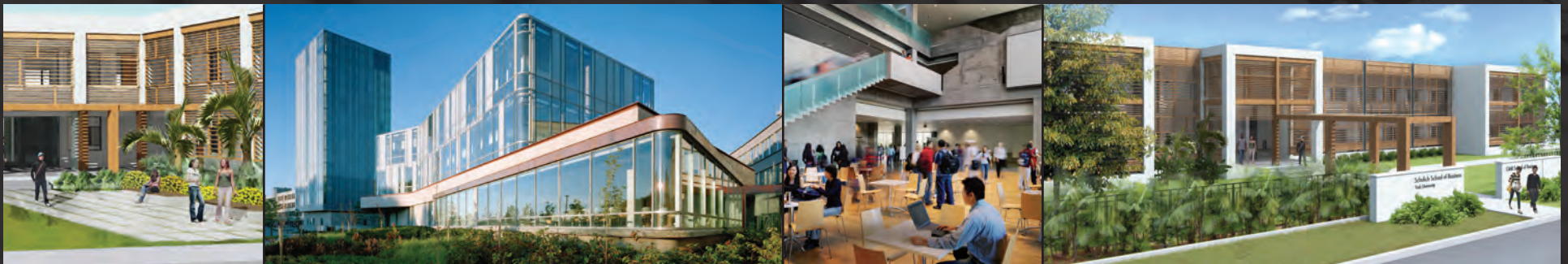
From left to right: A view of the central courtyard and pergola-covered patio at the Schulich GMR campus in Hyderabad, India; the $104-million facility at the Schulich School of Business in Toronto, Canada – ranked one of the 50 Most Beautiful Business Schools in 2013, awarded the Governor General's Medal in Architecture in 2006 and cited as one of the new breed of 21st-century business schools by the Financial Times ; the Schulich CIBC Marketplace (Toronto); and the main entry of the Schulich GMR campus (Hyderabad).

We know choosing your school is a big decision. We are here to guide you and provide as much information and assistance as you may need. Please call, e-mail or visit us. We're here to help.